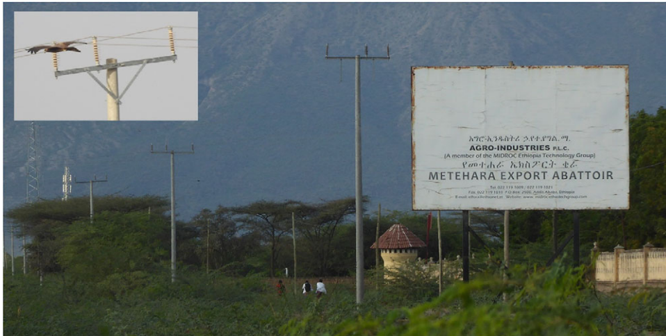
Figure 2. New power poles erected in 2019 as part of the National Electrification Programme near the Metehara Export Abattoir, a reliable food source for vultures. Based on mortality at other powerlines in this area, and the dangerous design of this new infrastructure, globally threatened vultures will likely be killed by this line every year. Inset shows detail of support structure of an already existing line with a Black Kite Milvus migrans .

between 07h00 and 18h00 hrs local time on 12 days in January, eight days in June, one day in October, and five days in December 2019. Because high mortality observed during a primary survey could have potentially been caused by chance, we re-surveyed two areas repeatedly (near Metahara and Logia; Figure 1) to exclude that the high mortality found under those lines during the first survey had occurred solely by chance. In Logia, a dangerous line that was constructed in 2017 under the National Electrification Programme was surveyed three times (January, June, December 2019), while in Metahara a new line was still under construction in December 2019. We therefore surveyed similar already existing lines in the vicinity in January, June, and October 2019 to document whether high mortality occurred only at certain times of the year. These repeated surveys occurred long enough apart that double counting due to carcass persistence was extremely unlikely (Barrientos et al. 2018), and we therefore present the average mortality rate separately for each month and location.