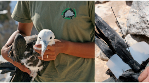
FIG. 1. Juvenile Ascension Frigatebirds were captured by hand and equipped with battery-powered platform terminal transmitters (PTTs). After the frigatebirds were released, a transmitter recorded positional data via the Argos satellite system on a 3-hr on/off duty cycle (on: 2400–0300; 0600–0900; 1200–1500; 1800–2100 hrs), with 1–23 fixes registered per day (mean = 8.5). The bill length of individual #135630 was 103 mm, the wing chord was 609 mm, and the mass was 1190 g.

insights into how abundance and distribution change over time and space (Romagosa and Labisky 2000, Callaghan and Gawlik 2015).